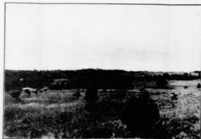
View from Estate looking East