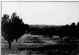
View of orchard on Estate looking North

A Subdivision of 15 beautiful lots, suitable for Speculators, Investors and Home Seekers, only 22 miles from Sydney by splendid concrete & macadamised roads, and the alternate tourist route to North Sydney. On the Main New Windsor Rd & Showground Road, Baulkham Hills. The land is well elevated & drained, & every lot has a beautiful outlook over all the surrounding district. Lots 1 to 6 have unsurpassed views of the Blue Mountains, fruit trees on each block. Lot 1 has a large dam and shelter sheds and is especially suitable for shops & refreshment rooms as hundreds of tourists pass the corner on week-ends.