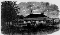
VIEW OF THE HOUSE.