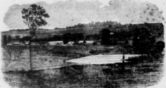
VIEW OF THE DISTRICT.