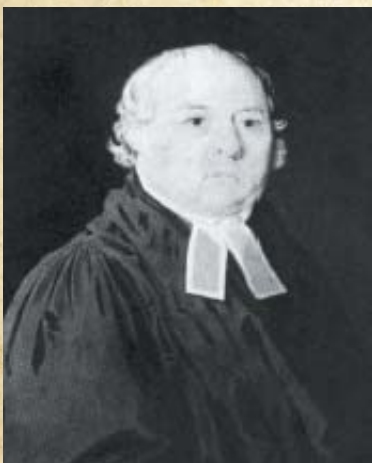
Reverend Samuel Marsden

Reverend Samuel Marsden , a Parramatta magistrate and parson, was the first person of authority to learn of the rebel uprising. However, he took no action and chose not to be directly involved in the conflict. Rev. Marsden was known as the 'flogging parson' as he often sentenced convicted prisoners to receive the lash.