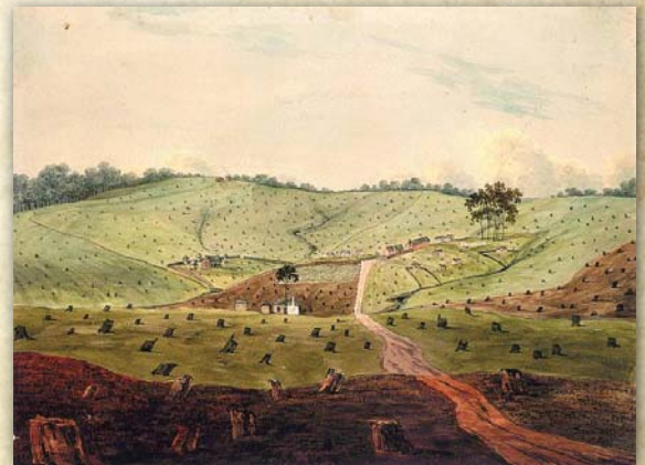
'View of Castle Hill Government Farm' c1803