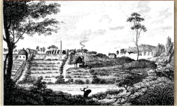
The western view of Government Farm at Toongabbie, 1796.