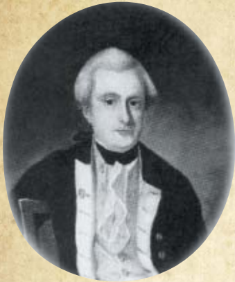
Governor Philip Gidley King

Governor Philip Gidley King was the third governor of the colony, from 1800-1806. Following the Castle Hill Rebellion at the Government Farm on 4 March 1804 he announced the Proclamation of Martial Law after declaring a state of insurrection. In 1806 he retired as governor and returned to England.