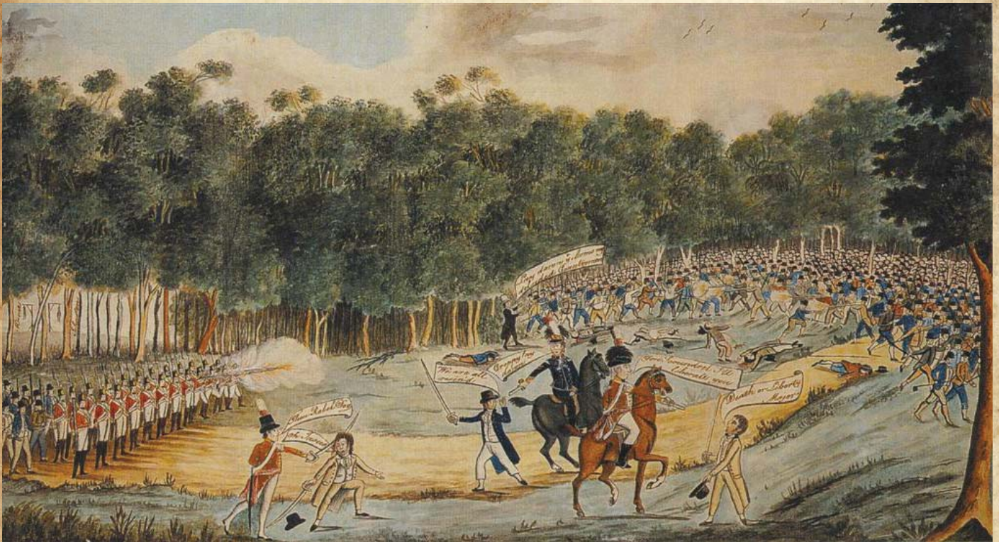
'Convict uprising at Castle Hill, 1804', depicting the Battle of Vinegar Hill

a brief history of The Castle Hill Rebellion & Battle of Vinegar Hill