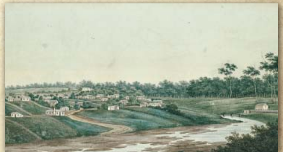
A view of Parramatta (G.W Evans)