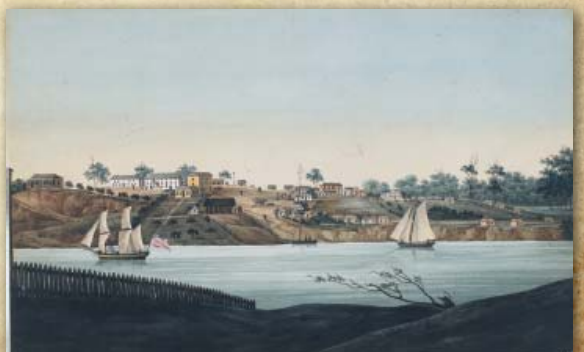
A view of Green Hills, Windsor (Lycett)