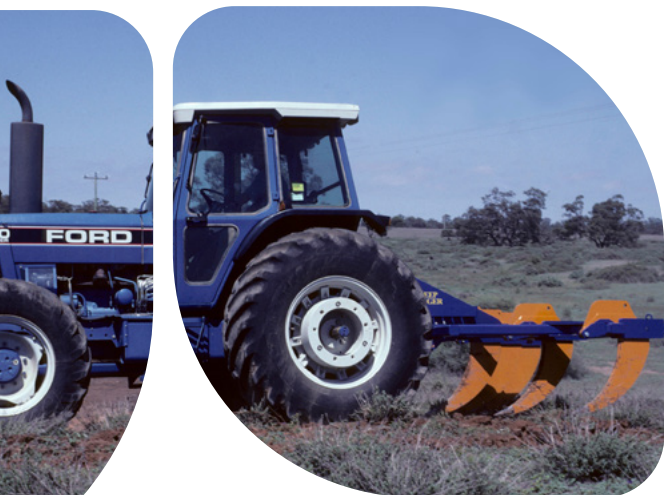
Warren ripper